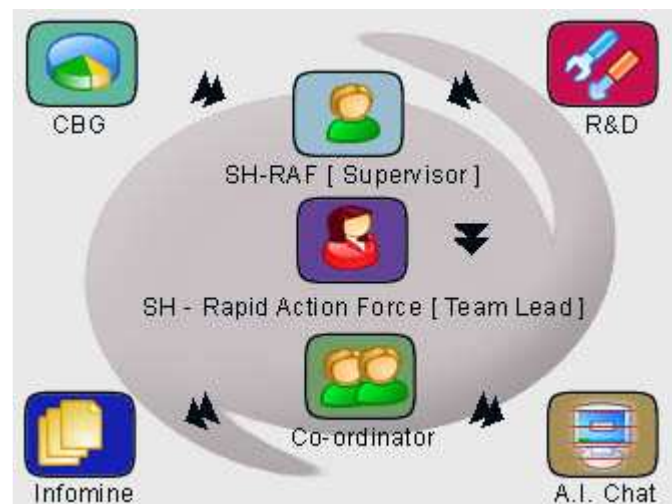
Cellular Model - Silicon House - Rapid Action Force™ Support System.

The support systems do not end here. It is constantly updated with the help of CBG [Core Business Group ] and R&D [ Research & Development ]. This ensures that our services not only meets your present requirements, but also takes care of future upgrades that we may have to undergo.