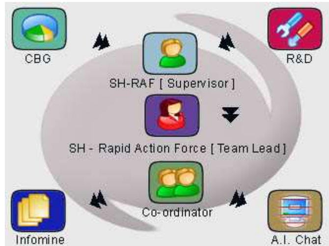
Cellular Model - Silicon House - Rapid Action Force™ Support System.

Infomine: Infomine is a key component in Automated Service Engine. It follows a similar industrial practice of Knowledge Management. It also includes interactive support systems.